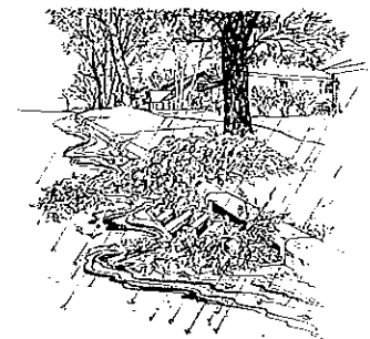
These leaves will be washed to the nearest lake or stream. The solution is simple: to keep it out of the lakes and streams, you've got to keep it out of the gutter and ditches.