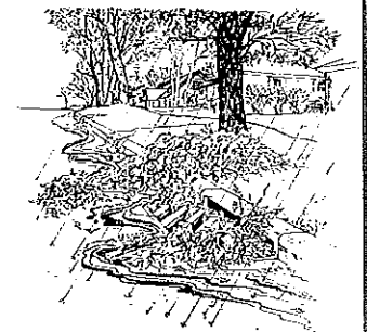
These leaves will be washed to the nearest lake or stream. The solution is simple: to keep it out of the lakes and streams, you've got to keep it out of the gutter and ditches.